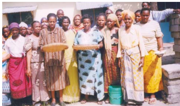
Members of three Tanzanian women's groups admiring sorghum buns baked during a training session in Dar es Salaam

The research portion of this project is targeted toward grain quality/product development issues that can be directly applied to improving U.S. sorghum quality as well as developing new prototype sorghum products applicable for U.S. consumption and export markets. This will include improvement in the quality of sorghum used in food products made for individuals with wheat intolerance and for sorghum-based snack foods that are shipped to Asian countries and will improve the quality of sorghum and pearl millet starch used for ethanol production.