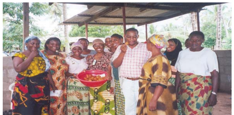
Dar es Salaam training participants tasting sorghum-based buns

INTSORMIL Report No. 16, December 1, 2007