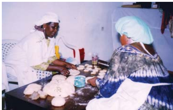
Training participants making chapatti dough in Dar es Salaam