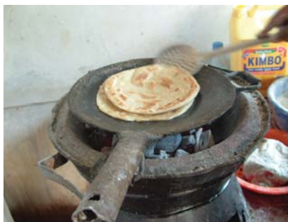
Chapatti cooking on a charcoal grill

“From our experience in Tanzania we anticipate an ever increasing number of sorghum-based food product businesses in East Africa, many of which are managed by women, who will then be able to increase their family’s standard of living.”