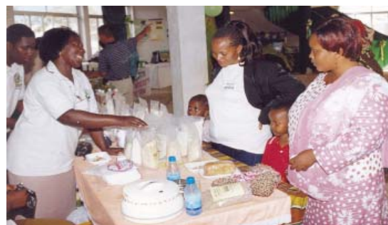
Sorghum and pearl millet-based food products on display at a food fair in Tanzania